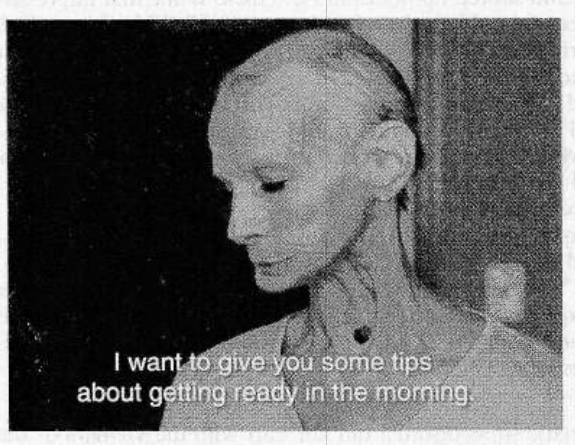
One of the powerful 'Tips From Former Smokers' TV ads

Television ads have proved a hugely successful way of rebranding smoking. One campaign in particular terrified huge numbers of smokers into chucking away their cigarettes: the 2012 "Tips From Former Smokers" campaign by the Centers for Disease Control and Prevention (CDC), which featured harrowing videos of people who'd developed cancer, diabetes, emphysema, and other diseases as a result of smoking. "During radiation treatments I'm still smoking because I'm that addicted," said one of the former smokers, who had a mechanical voice and prominent tracheotomy hole in his throat. "It wasn't until they took out my voice box and I breathed through a hole in my neck that I finally quit." In the three months after these ads aired, 200,000 Americans quit smoking. CDC Director Tom Frieden says the ads represented a "David vs. Goliath" victory against the tobacco industry, which spends